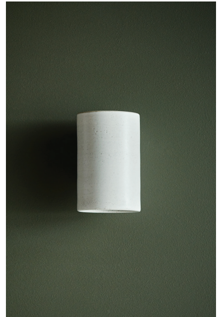
Earth Light, wall mount, regular – Speckled white gloss