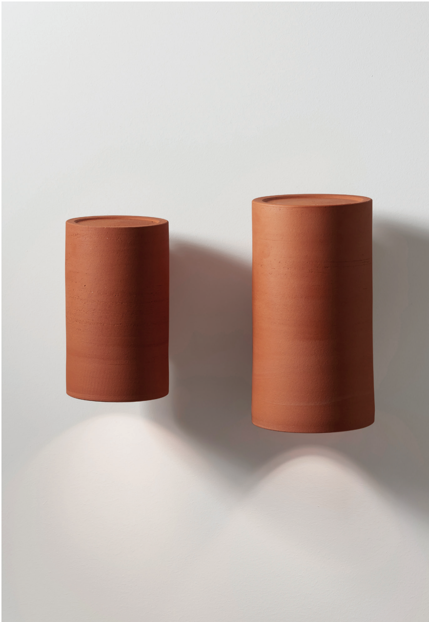
Earth Light, wall mount, regular and large – Terracotta