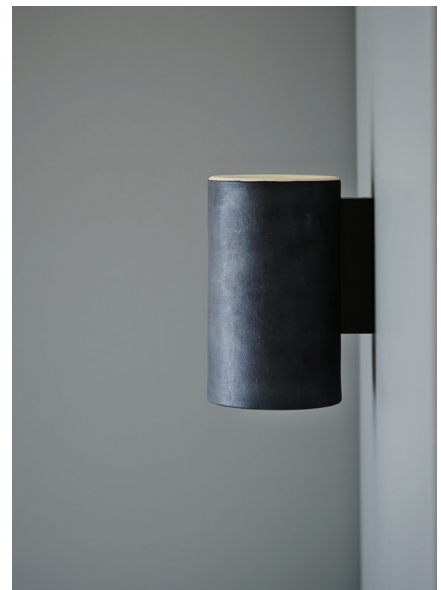
Earth Light, wall mount, regular – Charcoal

The Earth Light has been designed in wall, pendant and ceiling mount formats. The elemental geometric form is both simple and architectural; all fittings are thrown on a potter's wheel giving each light a unique quality and a surface rich with the evidence of its handmade process.